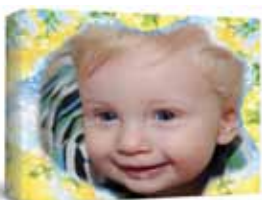
Creative Wrap (Exclusive Fix-a-Frame)

After the canvas is stretched, you can choose to frame the wrapped canvas with one of our specialized custom frames, or display it exactly as is.