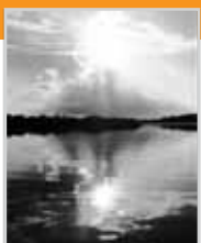
BLACK & WHITE