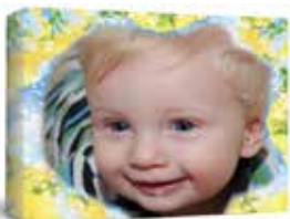
Creative Wrap (Exclusive Fix-a-Frame)

After the canvas is stretched, you can choose to frame the wrapped canvas with one of our specialized custom frames, or display it exactly as is.